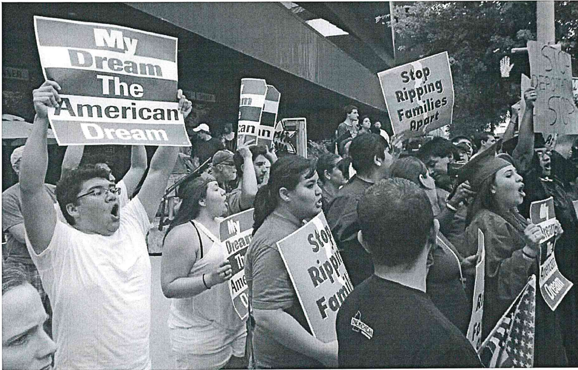
DREAM Act activists gather together to demonstrate in Austin, Texas during President Obama's visit to the city in May 2011.

Some states have also introduced or passed state-level DREAM Acts. These acts provide funding for education and assistance for undocumented, in-state college attendees. (Activism around the DREAM Act led to the use of the term “Dreamers” to describe the young people who would benefit from the passage of such an act.)