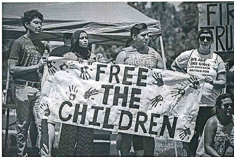
Demonstrators at the “Families Belong Together” march in Iowa, June 30, 2018. More than one thousand people attended the march to protest the enforcement of policies that separate undocumented children from their parents.

This photo, and other images and stories of refugees making dangerous journeys, drew international attention. Many countries—including the United States—have struggled to respond to the crisis, juggling humanitarian concerns with concerns about their economy, security, and culture. While people in the United States have long discussed the role that the United States should