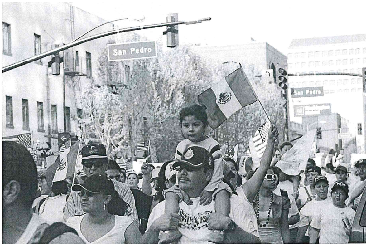
Supporters of immigrant rights march in San Jose, California in May 2006.

place in more than 160 cities. The protests began in February and March of 2006 and soon spread to cities across the country. The largest protest took place in Los Angeles in May 2006 where more than six hundred thousand people demonstrated their opposition to the proposed laws. Protests also took place in cities where immigration activism had not historically played a major role in shaping policy, bringing even more voices into the conversation. The proposed law that sparked these protests failed to pass, largely due to the activists' efforts. Since then, activists have continued to fight for undocumented peoples' rights.